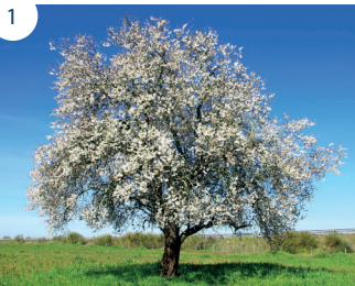
1 Almond Blossom

Almond blossom colours the countryside in white and pink throughout Jan-Feb. An 11km Almond path in Castro Marim has been developed to provide visitors access to this beautiful scene.