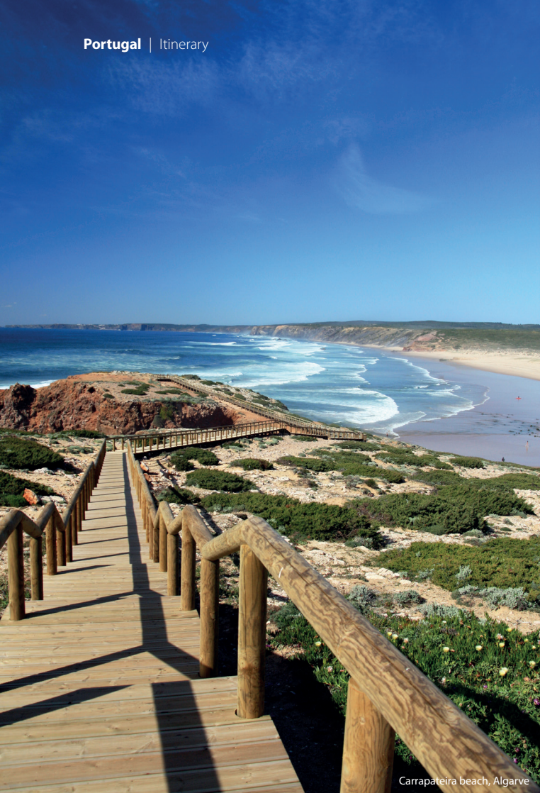
Carrapateira beach, Algarve