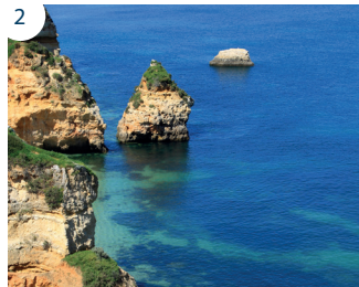
2 Ponte da Piedade

Almond blossom colours the countryside in white and pink throughout Jan-Feb. An 11km Almond path in Castro Marim has been developed to provide visitors access to this beautiful scene.