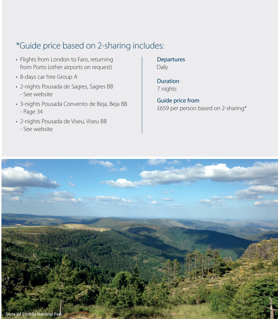
Serra da Estrela National Park